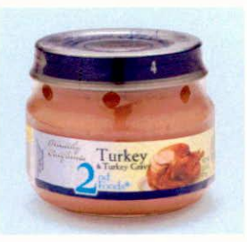
Well-pureed meat, like turkey