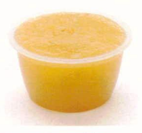
Pureed fruits, like unsweetened applesauce