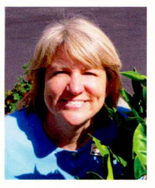
WIC Counselor TIP

At around 9 months, your baby will start using her thumb and fingers to pick up small things. She can start learning how to feed herself! Give her some finger foods so she can practice. Try small pieces of soft fruits or softcooked vegetables, small pieces of dry cereal, and small pieces of dry toast. It's important to always have your baby sit down when she is eating, and stay near her in case she starts choking.